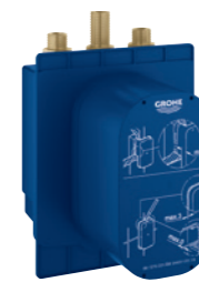
36 459 000 Concealed body for shower with transformer 100 – 240 V AC and integrated thermostatic mixer suitable for infra-red set 36 456 000