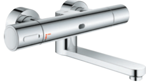
36 454 000 Infra-red electronic wall basin mixer with thermostatic temperature control GROHE SafetyPlus fixed temperature stop projection 287 mm