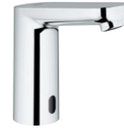
36 439 000 M-Size Touchless basin faucet battery operated without mixing device