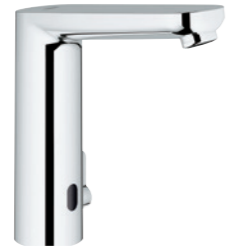
36 422 000 L-Size Touchless basin mixer battery operated with mixing device and adjustable temperature limiter 36 421 000 with transformer 100 – 240 V AC