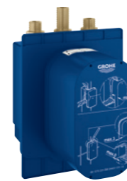
36 458 000 Concealed body for shower battery operated with integrated thermostatic mixer suitable for infra-red set 36 456 000