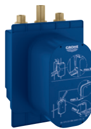
36 464 000 Concealed body for shower battery operated with integrated pre-adjustable thermostatic mixer suitable for infra-red set 36 463 000