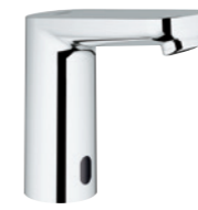
36 330 001 M-Size Touchless basin mixer battery operated with hidden mixing device and adjustable temperature limiter