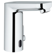
36 327 001 M-Size Touchless basin mixer battery operated with mixing device and adjustable temperature limiter 36 325 001 with transformer 100 – 240 V AC