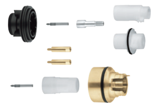
47 780 000 Extension set 27.5 mm for 36 458 000 / 36 459 000