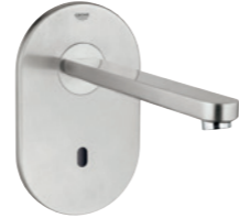
36 334 SD0 Touchless wall basin faucet without mixing device projection 232 mm 36 335 SD0 projection 172 mm 36 336 001 / 36 337 001 Concealed mounting box