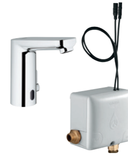
36 386 001 M-Size Touchless basin mixer Powerbox – power generator with water turbine with mixing device and adjustable temperature limiter