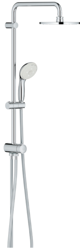
27 389 002 Tempesta System 200 Flex shower system with diverter for wall mounting