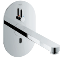
36 376 000 Touchless basin mixer with mixing device and adjustable temperature limiter projection 232 mm 36 315 000 projection 172 mm 36 339 001 Concealed mounting box